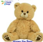
Honey the Bear