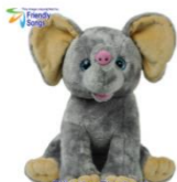
Ellie the Elephant

and select your favorite stuffed animal. You can even add a Heart, Birth Certificate, and Gift Wrapping if you wish.