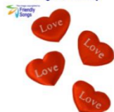
Heart for Stuffed Animal