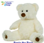
Banjo the Bear